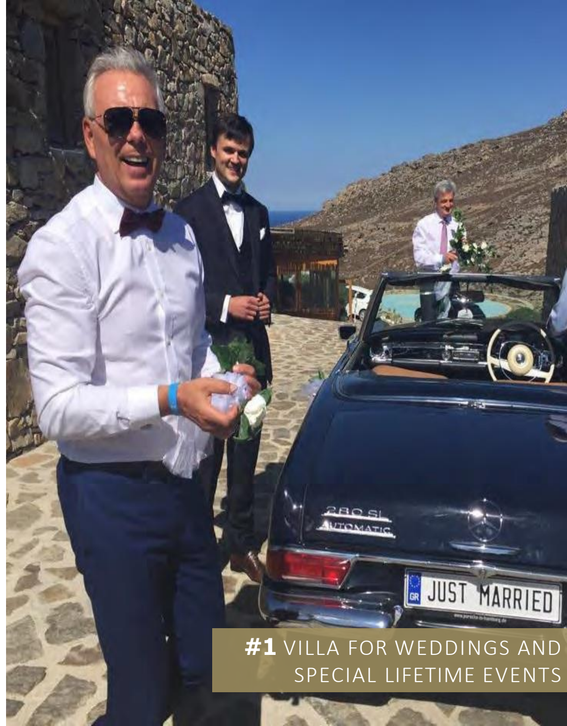
#1 VILLA FOR WEDDINGS AND SPECIAL LIFETIME EVENTS